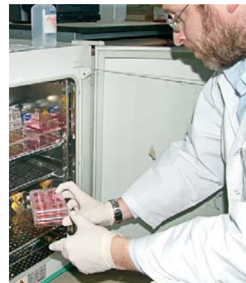
Lung Cancer Cells